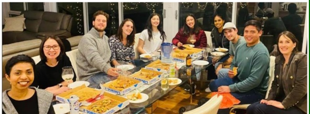
Recent pizza social